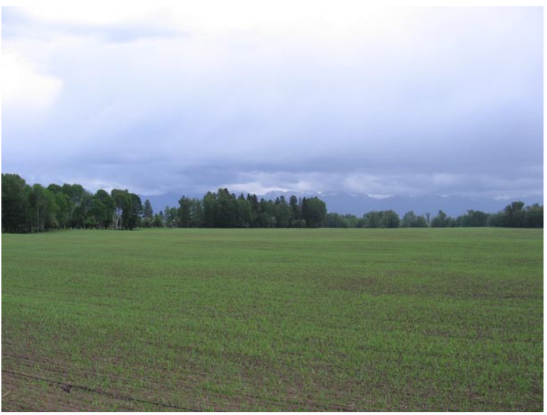
Crops grown on the Louden property include wheat, barley and alfalfa.

work being done under the River to Lake Initiative, a collaborative effort between conservation organizations, landowners like the Loudens, agencies and others to protect critical lands along the main stem of Flathead River to the North Shore of Flathead Lake. To learn more about River to Lake Initiative projects, see page 5, and check out our website at www.flatheadlandtrust.org.