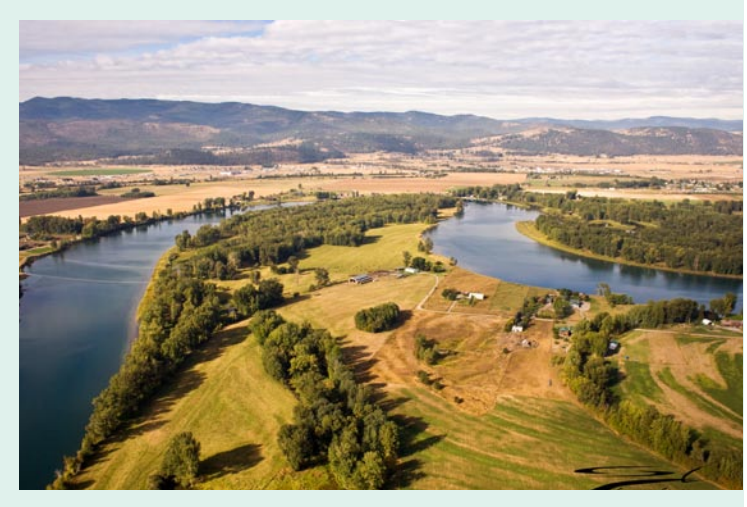
Foy's Bend along Flathead River has nearly two miles of riparian riverbank.

Two other projects were initiated by Flathead Land Trust and wrapped up by other entities. Marilyn Wood and Ken Siderius of the Land Trust first contacted Cap