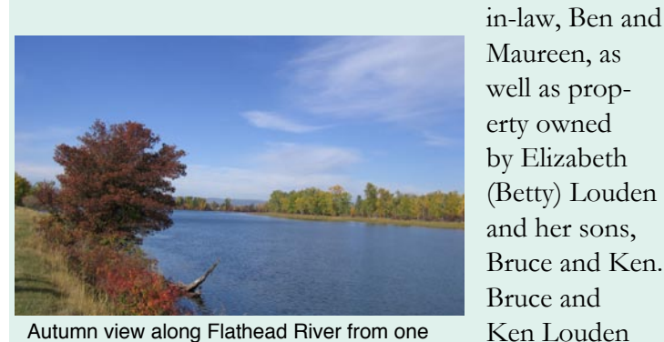
Autumn view along Flathead River from one of the Louden properties under conservation easement with FLT.

under easement. The project areas include land owned by Bernice (Bunny) Louden and her son and daughter-