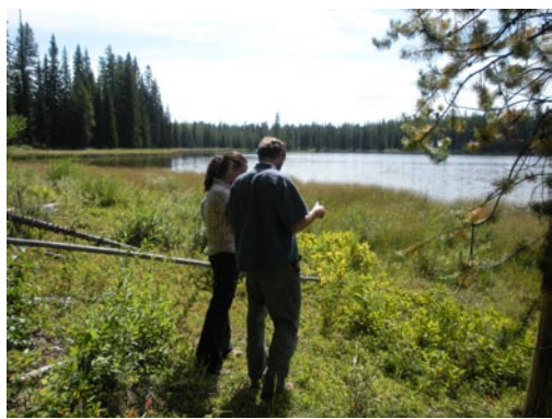
FLT staff visit prospective easement properties as part of the project assessment process.

a preliminary assessment based on FLT selection criteria. For example, what are the property's special conservation features? Are there adjacent land uses that may conflict with the easement? If the project meets the