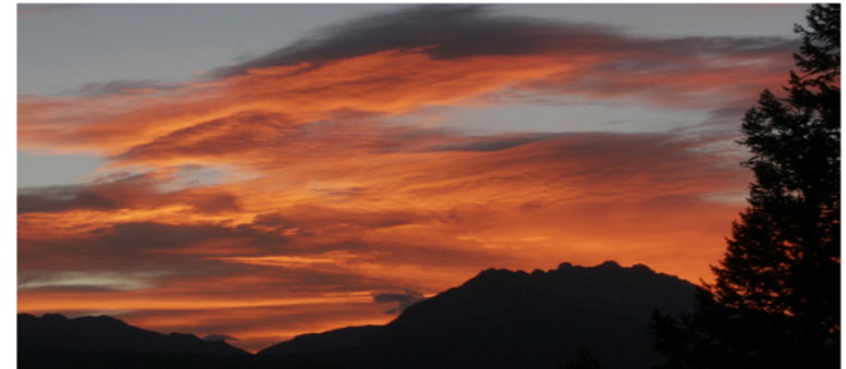
Sunrise over the Foreman Family Trust easement in the North Fork.