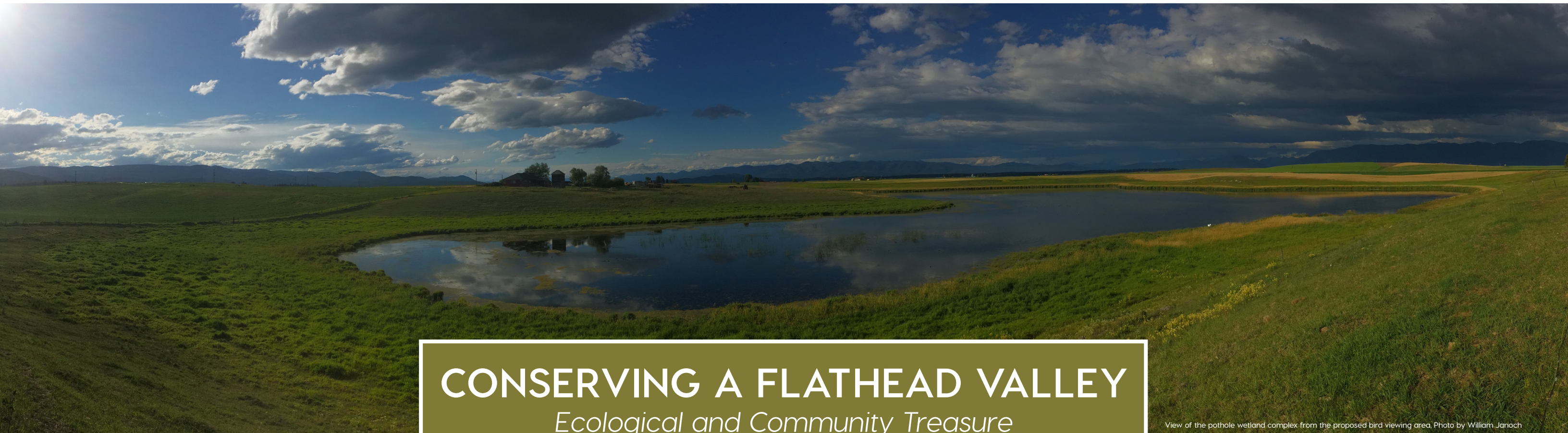
View of the pothole wetland complex from the proposed bird viewing area.