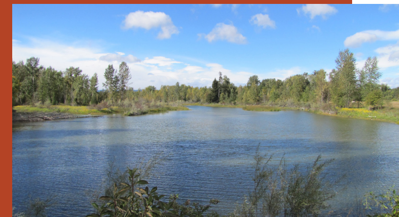
Brenneman property along the Flathead River

The two most recent projects accomplished with funding from the NAWCA grant were completed by partners in May and July. In May, Flathead Land Trust helped to facilitate the purchase of a conservation easement on the 155-acre Brenneman property by Montana Land Reliance. The Brenneman project protects a family farm and adds to a block of properties under conservation easements protecting a total of over 900 acres, 1.7 contiguous miles of the Flathead River, and many miles of other backwater channels and sloughs in the braided reach of the river east of Kalispell. One of the sloughs the Brenneman project protects is spring-fed and rarely freezes in winter providing migratory waterfowl with an oasis of open water in a frozen landscape. In July, Flathead Land Trust facilitated the purchase of the 30-acre Frey property along the Mission