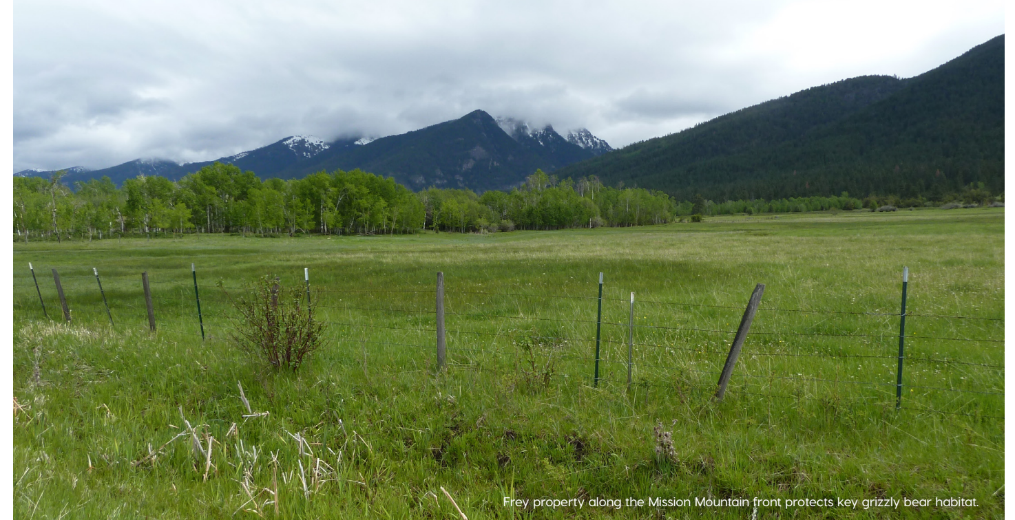
Frey property along the Mission Mountain front protects key grizzly bear habitat.

Exponentially Increases Conservation Success