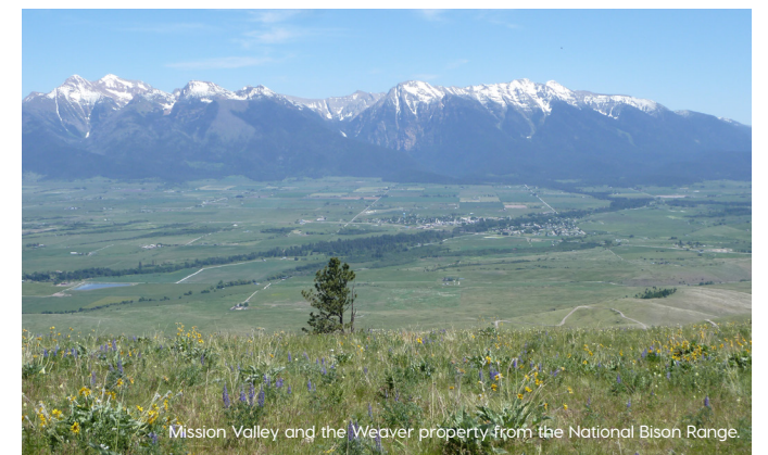
Mission Valley and the Weaver property from the National Bison Range.