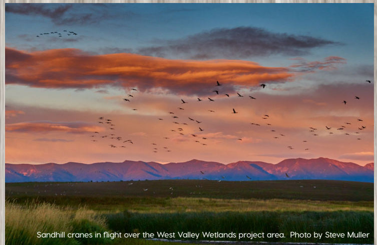
Sandhill cranes in flight over the West Valley Wetlands project area.

Give a year-end gift or join as a monthly donor this year and make your money go farther. Visit www.flathead-landtrust.org for details and to donate or send a check to PO Box 1913, Kalispell, MT 59903